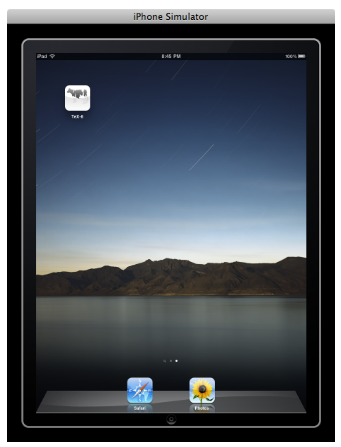
Figure 3 The T<sub>E</sub>X-8 application in its natural habitat